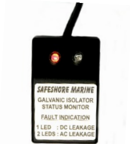
Remote status monitor fitted with 4 metres cable which may be cut or extended up to 30 metres.